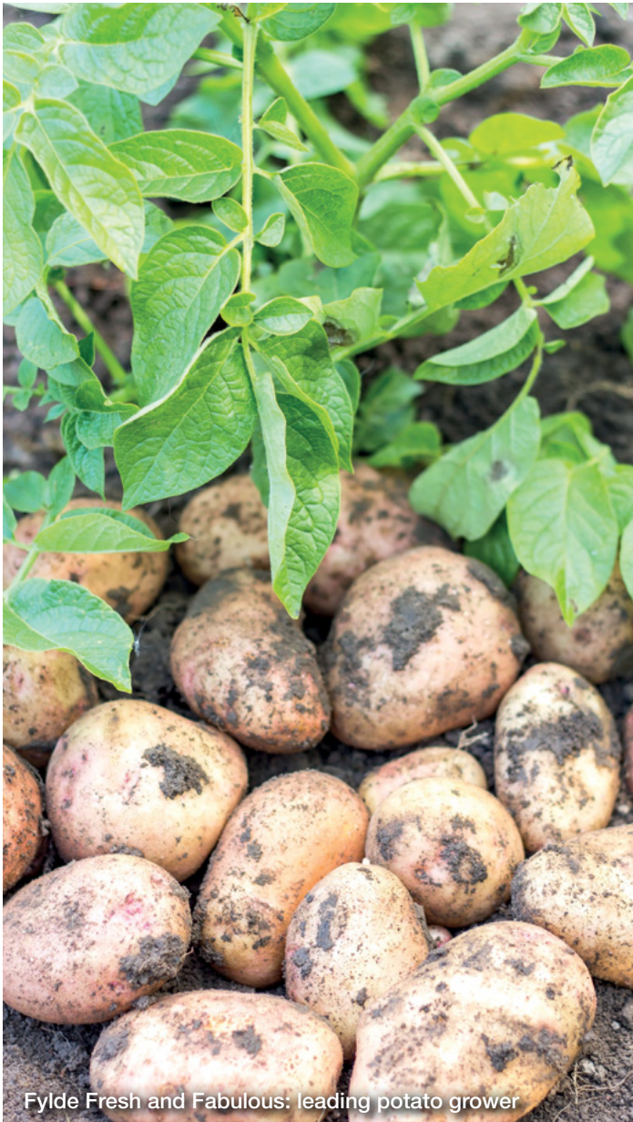
Fylde Fresh and Fabulous: leading potato grower