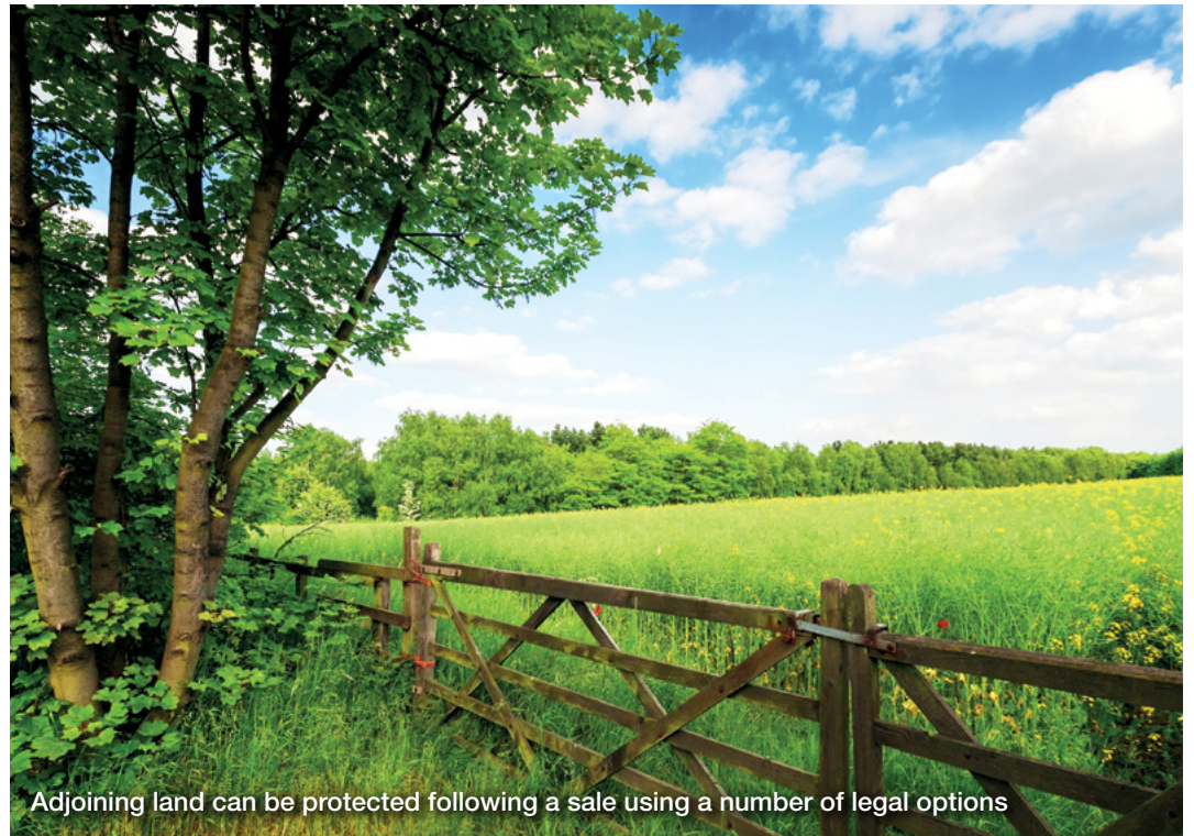
Adjoining land can be protected following a sale using a number of legal options

Andrew.Holden@napthens.co.uk 01254 686216