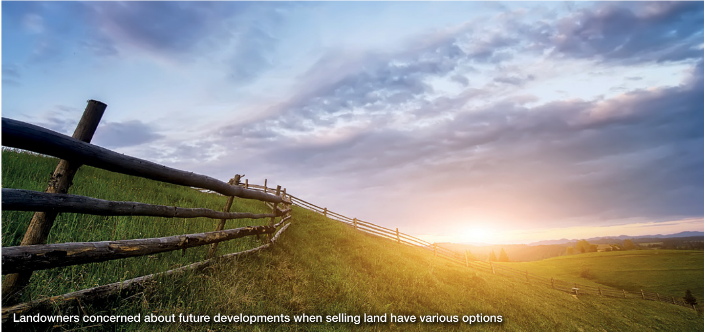
Landowners concerned about future developments when selling land have various options